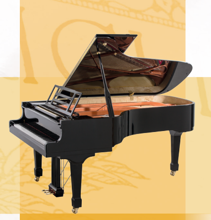
Mod. 218 - Concert I