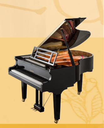
Mod. 179 - Dynamic II