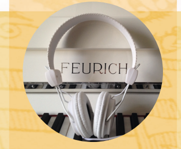
Silencer Systems for all models