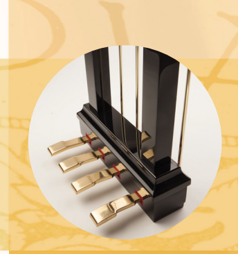
Pédale Harmonique for all grand pianos