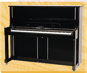
Mod. 125 - Design