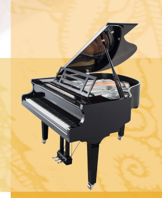
Mod. 162 - Dynamic I