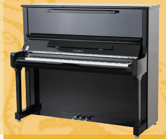
Mod. 133 - Concert